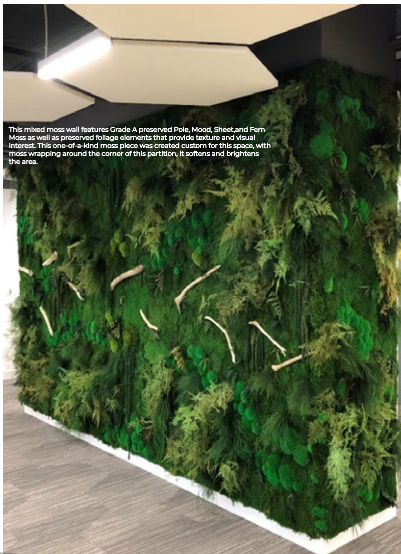
This mixed moss wall features Grade A preserved Pole, Mood, Sheet, and Fern Moss as well as preserved foliage elements that provide texture and visual interest. This one-of-a-kind moss piece was created custom for this space, with moss wrapping around the corner of this partition, it softens and brightens the area.

These safely distanced, semi-private nooks provide a quiet space for patrons to relax. Each seating area is placed next to a custom design moss wall partition that contains a glass water feature. Water trickles quietly in between two glass panes and is recaptured in a hidden reservoir, this closed-loop system allows for continuous flow of water. The perfect place to sit and enjoy natural elements within the workspace.