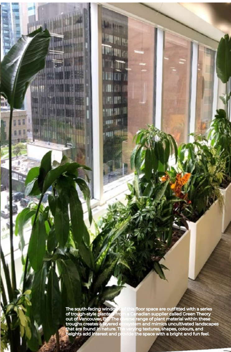
The south-facing windows of this floor space are outfitted with a series of trough-style planters from a Canadian supplier called Green Theory out of Vancouver, BC. The diverse range of plant material within these troughs creates a layered ecosystem and mimics uncultivated landscapes that are found in nature. The varying textures, shapes, colours, and heights add interest and provide the space with a bright and fun feel.